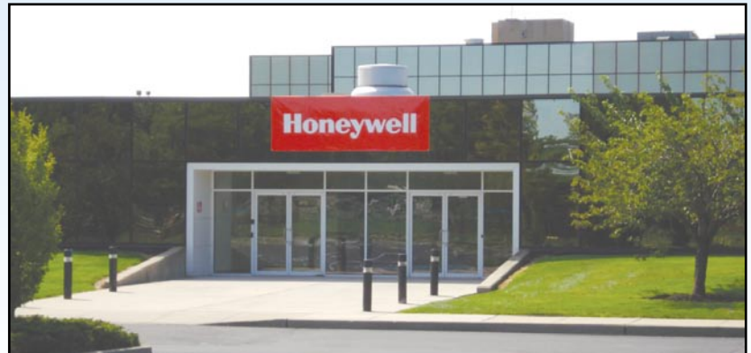
Honeywell Security's headquarters at 2 Corporate Center Drive, Melville, NY